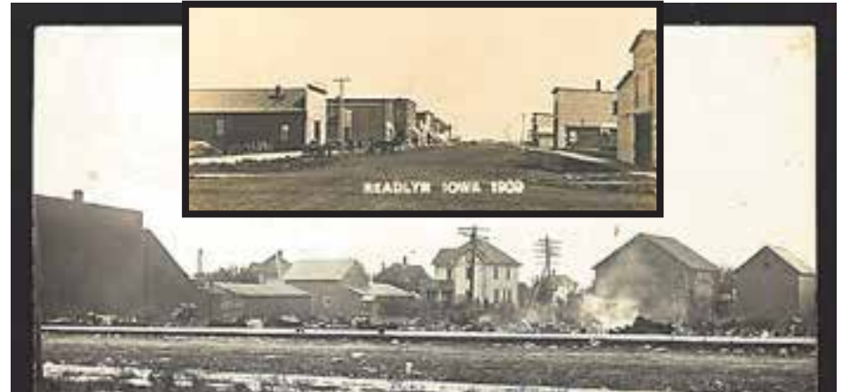
Photo at top: Main Street in 1909, before the fire station was constructed. The bottom photo shows the aftermath of the fire of 1912. Estimated value of loss was $100,000 which would be approximately $3,253,659 today.

But just a few years later, in 1912, a devastating fire swept through Readlyn, destroying much of the business district that had been carefully built in those early years. The fire left the town's residents shaken, but they were quick to take action. Recognizing the need for better fire protection, the citizens rallied together to raise funds for a pumping station. In 1913, a bond for $6,000 was approved by a strong majority—91 votes in favor, and only 6 against. Soon after, the town rebuilt Main Street and constructed a concrete-block pump station, which would also serve as the town council room, jail and eventually a library. That very building, still standing