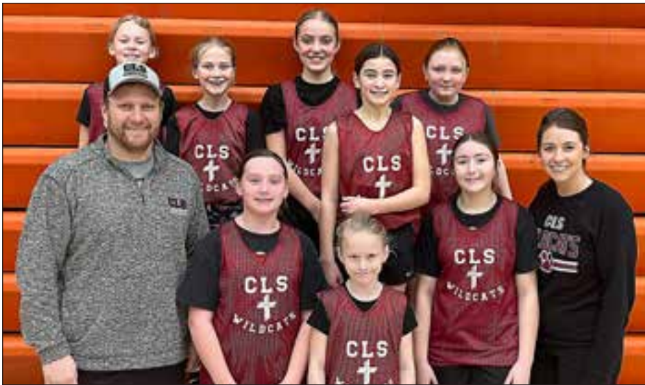
Congratulations to the Community Lutheran School's Wildcat basketball team and coaches on a successful and exciting basketball season playing other 5th and 6th grade teams from other area towns! Go Wildcats!