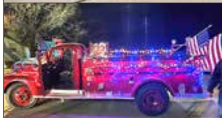
Readlyn's first ever fire truck was this 1946 Ford. The department still uses this to participate in various community events such as the Lighted Parade during Christmas.