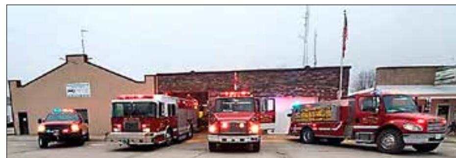
The current line up of vehicles minus the grass truck and UTV.