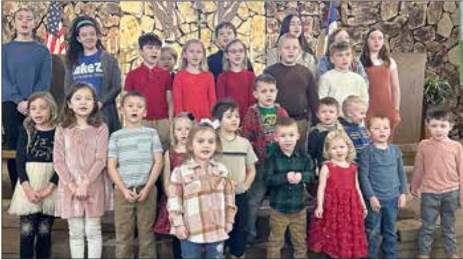
CLS students sang the hymn "As With Gladness Men of Old" at St. Paul on February 9! Glory be to God!