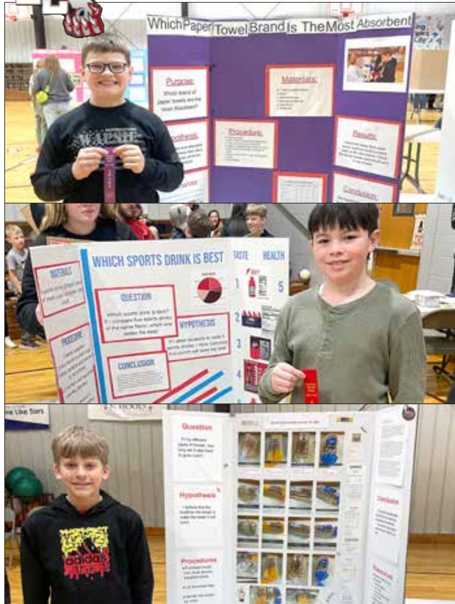
CLS and St. Paul's Latimar competed in a Science Fair at CLS on January 24. Thank you to all of the students who participated and to the parents, teachers, and staff who made this day possible! Above are just a few of the participants.