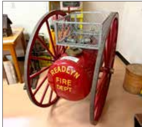
Readlyn's first fire-fighting apparatus. This is a chemical extinguisher and had to be pulled by hand or behind a team and wagon. It was used to handle the fire that took place on the west side of Main Street in 1912 that wiped out six businesses.

Readlyn Emergency Services has proudly served the community for over a century, growing and evolving with the needs of the town. However, our current building—dating back to 1913—can no longer adequately support the modern equipment, expanded personnel, and critical services we provide today. With a growing team and increasing demands for fire and emergency medical services, we are outgrowing our space and need a new, larger facility to continue serving the community effectively.