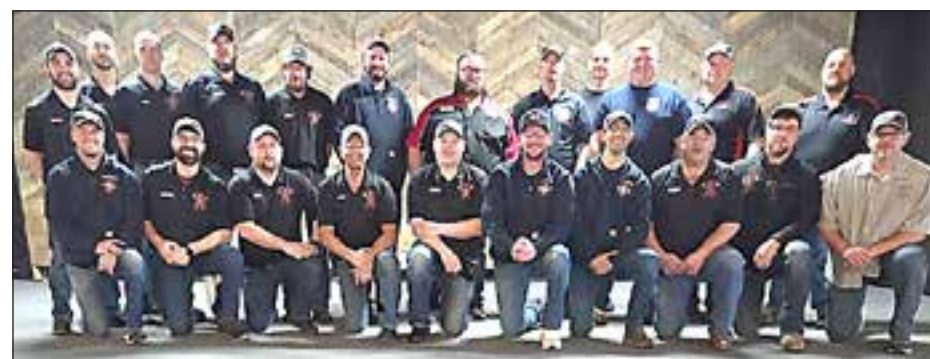
Currently, the fire department has 25 active volunteers.

The department's growth isn't just in its equipment; it's in its people. The members of