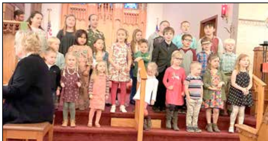
The students sang their praise to our Lord and Savior at Immanuel Klinger Nov. 10.