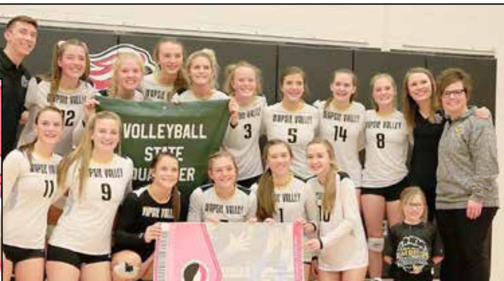
Congratulations to the Wapsie Valley Warrior volleyball team on their success at making it to the IHSGAA State tournament on November 13! Your community is so proud of your accomplishments and hard work! Warrior Power!