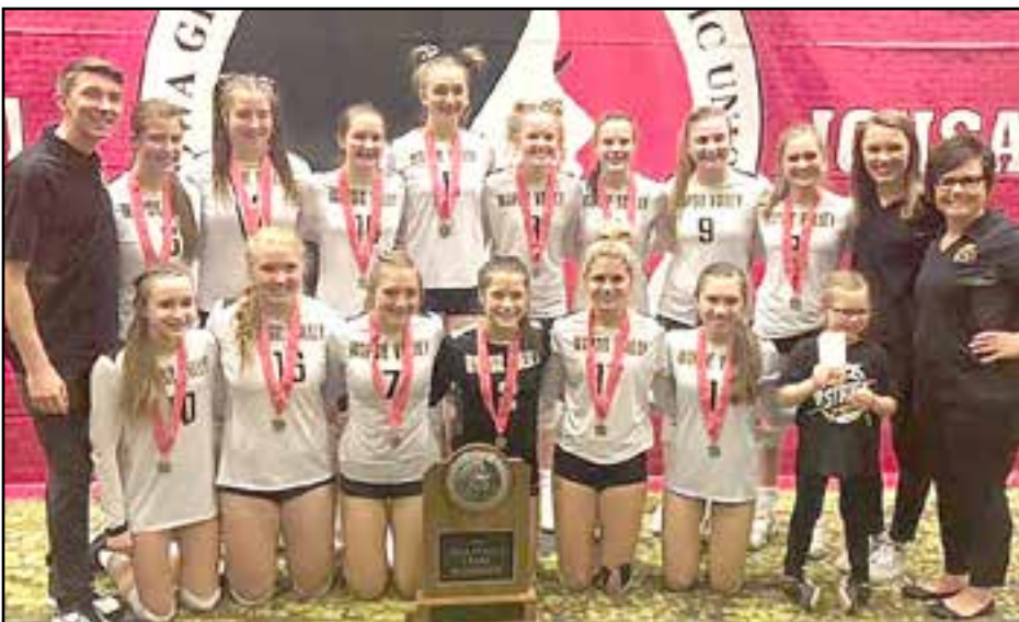
Congratulations to the Wapsie Valley volleyball team, Iowa's 2019 class 1A State Volleyball Runner Up Champions! With all of Iowa watching, you represented our awesome community with heart and determination. We are proud of you!