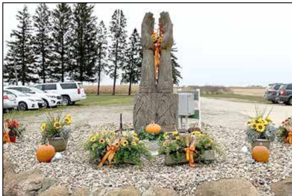
Thank you to those who keep our church beautiful; all to glorify God!