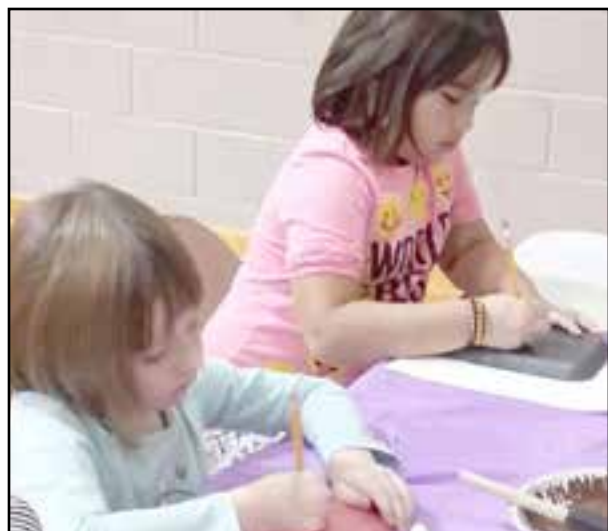
Students explore screen printing activity at the Reformation Celebration.