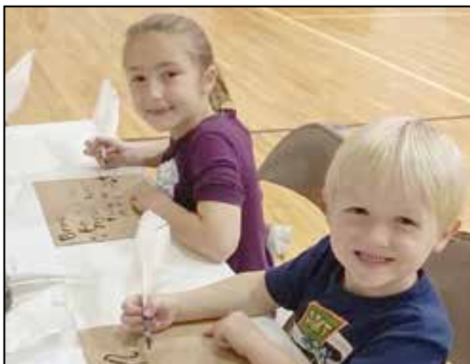
Quill writing — The students explored different methods used to print in the 1500s, the time when Martin Luther nailed the 95 theses in Germany.