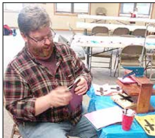
Pastor demonstrates his printing press at our Reformation Celebration.