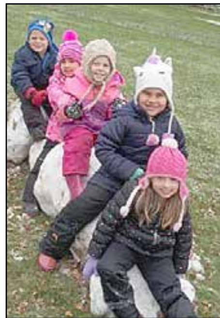
Students enjoy their first snow of the year snowballs.