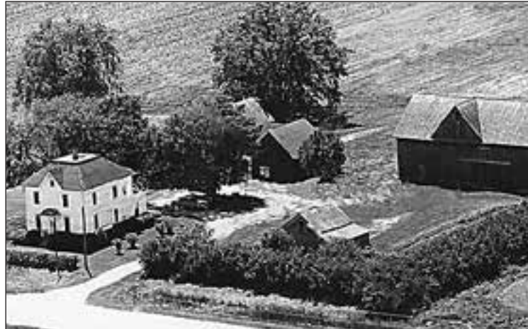
The Clarence Ganske farm, circa 1970, is located north of Readlyn.