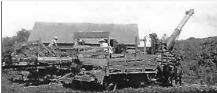
Threshing on the Ganske farm, 1941.