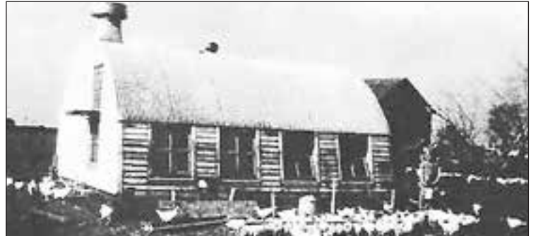
Shirley Ganske stands by the brooder house in 1945. A brooder house is a small building for newly hatched chicks. It provides warmth with a light, protection and food. The chicks stay in it for about six weeks.