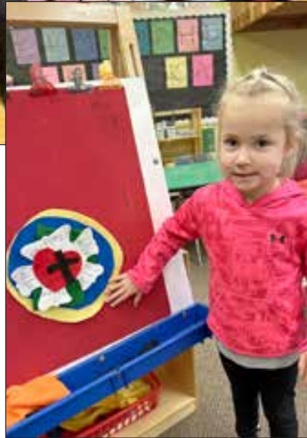
Indy created Luther's seal on the flannel board.