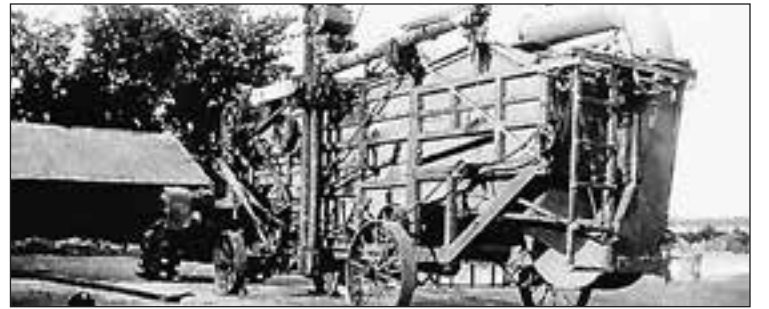
This is a threshing machine in a farmyard - 1941.