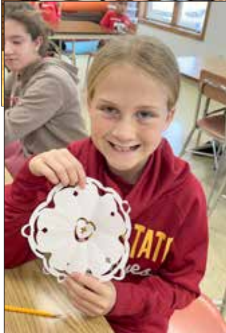
Isabella cut out a Luther's seal from paper.