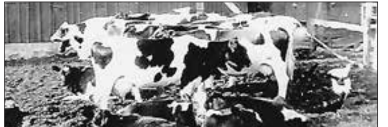
Ganske farm, 1935. Holstein cows are used for milking.