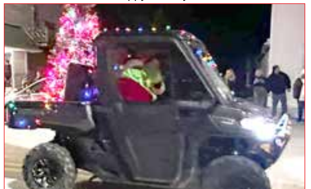
Hey, Grinch - you can't steal our Christmas spirit!