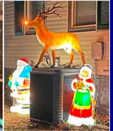
First Place - Gary and Connie Sauerbrei, 407 Goodell