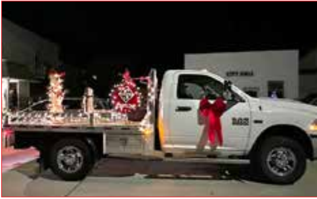
Larry's Service and Repair