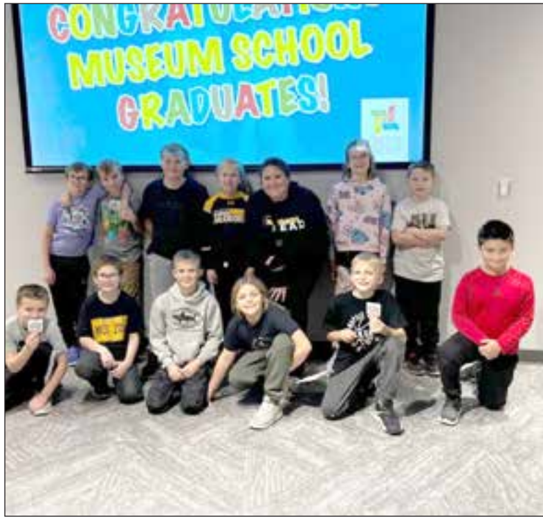
Our 3rd grade students participated in Museum School at the Grout Museum. So FUN!

It's been busy at Readlyn Elementary. Here are some fun things we've done the past couple months.