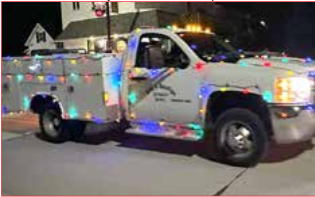
Readlyn City Workers