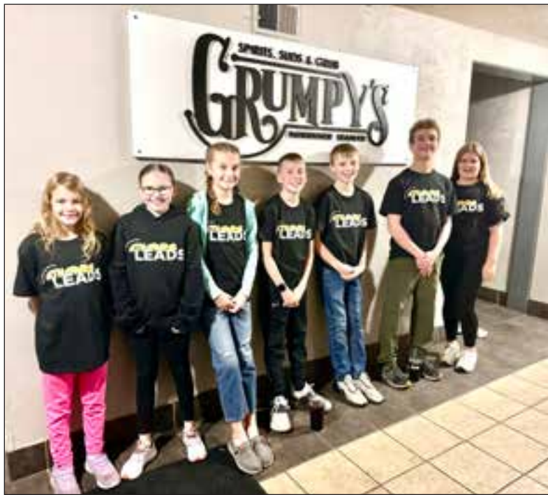
Our 6th grade lighthouse team and action team participated in the lighted parade during Readlyn's Christmas on Main (below). They also helped at the WV Education Foundation Dinner (above).