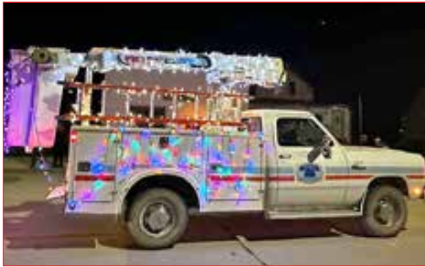
RTC - Readlyn Telephone Company