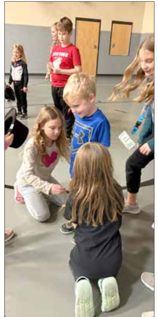
Leader in Me Assembly Habit 3: Put First Things First! We work before we play!