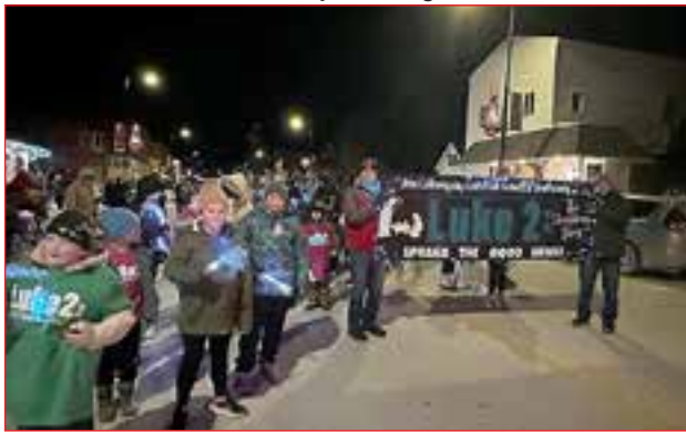
CLS - Luke 2 ... the Reason for the Season