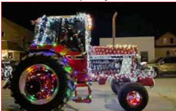
So shiny and bright!