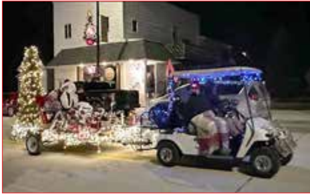
Here comes Santa Claus!