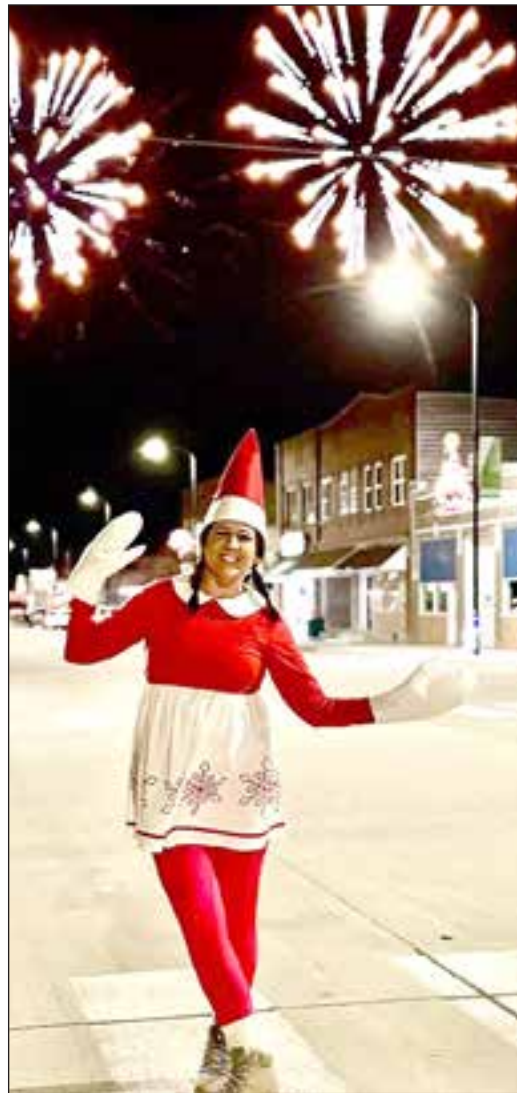
Cookie the Elf made it safely to Readlyn Elementary.