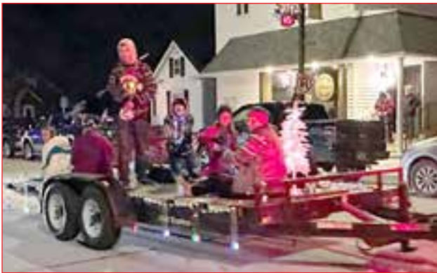
Wapsie Valley FCCLA - Spreading joy!