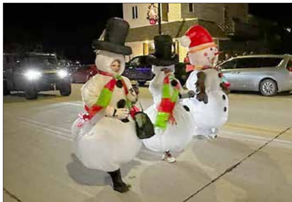
The only snowmen to be seen so far this year were these three mystery snowmen in the Readlyn Lighted Parade! See more photos of Christmas on Main on pages 10 and 11.