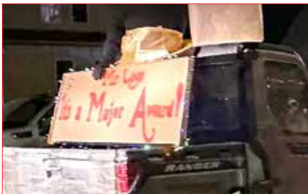
The One and Only Fabulous Mr. Legs!